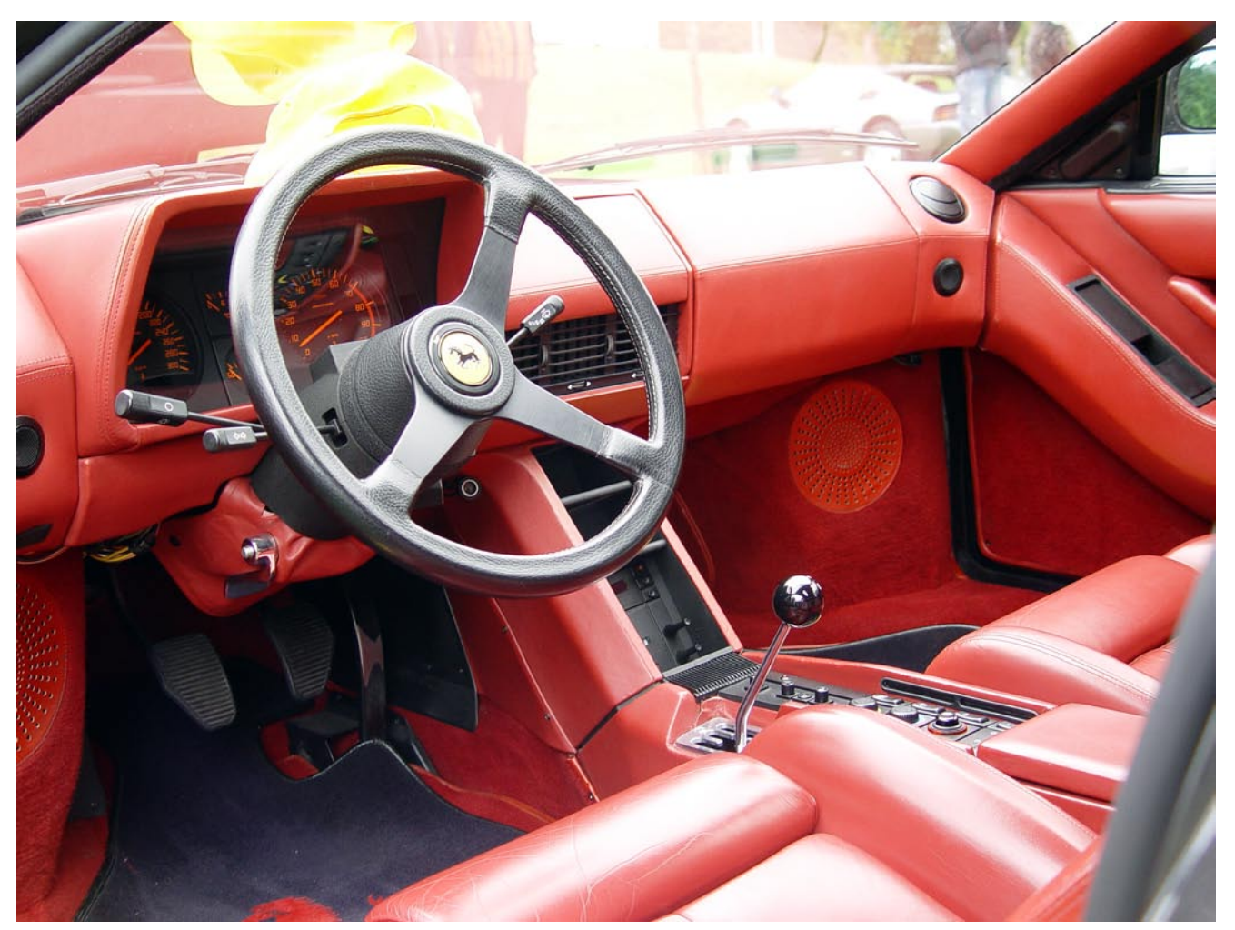
The interior of the car is classic '80s with large orange dials in the dash. The interior pictured here is a Testarossa, the later 512 TR and F512 M both had minor updates to modernize the car.

• Flat-spotted tires on cars that have been sitting